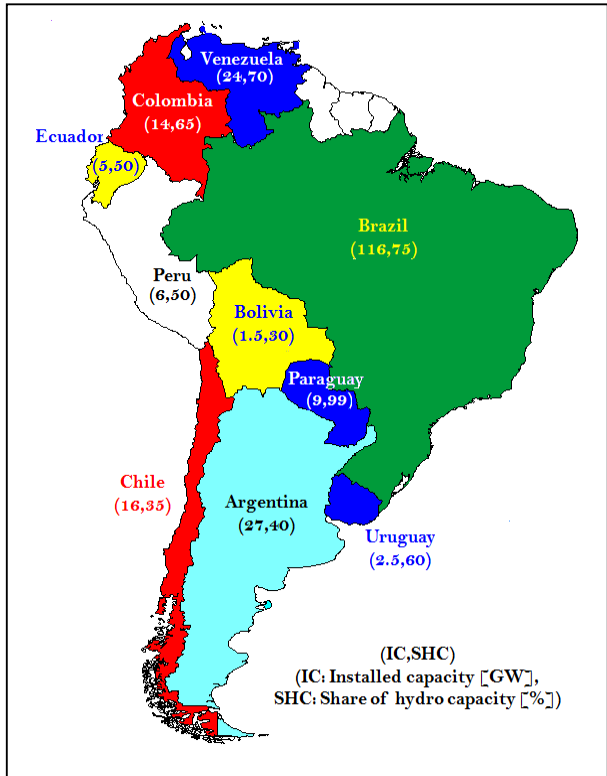
Figure 2. Installed capacity and hydro share and hydro potential in South American countries.

We already count on a very significant number of experiences and literature that can help us in assessing the efficiency of the different alternatives to promote RES. Nevertheless, many of the conclusions, particularly the ones extracted from the experiences in developed countries, cannot always be directly exported to the South American ones, since they differ not only due electricity industry to their physical characteristics (clean energy matrices with predominance of hydropower, and still a significant amount of untapped large hydro potential) but also to their regulatory characteristics - any of the countries has yet entered into any international climate change commitment and for instance most countries' regulatory framework has somehow returned to regulator-driven long-term contracting, see Batlle et al. (2010)- and to their specific